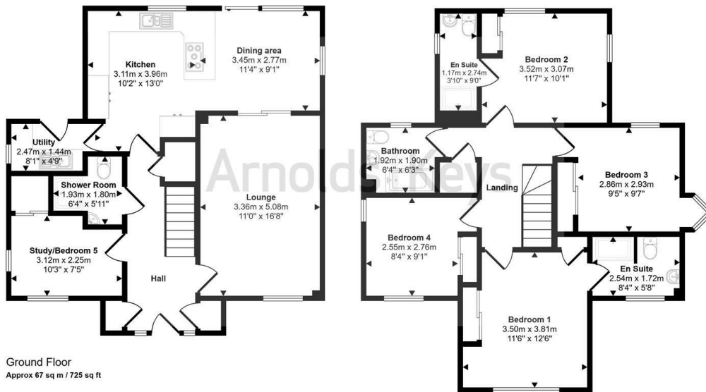
Ground Floor Approx 67 sq m / 725 sq ft